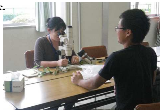
A meeting on the timing to start spraying

Providing guidance on tea field management, including skiffing, soil management, and pest control in tea production fields. We especially provide guidance on the timing of pest control based on the accumulated effective temperature of the mulberry scale.