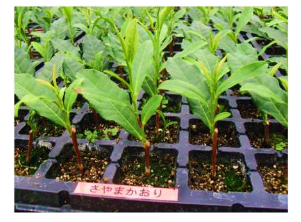
Cell (plug) formed saplings

We have developed cultivation techniques to avoid damage from cold drought and late frost. In recent years, we have been focusing on the development of cultivation techniques to cope with abnormal weather conditions and to avoid late frost damage. We have also been conducting research and providing technical advice on how to cope with abnormal weather, how to effectively renew old tea fields, and how to improve planting using cell (plug) formed saplings.