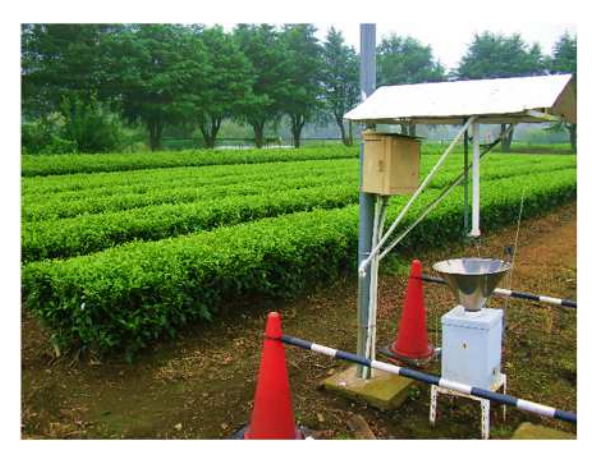
Pest occurrence investigation field