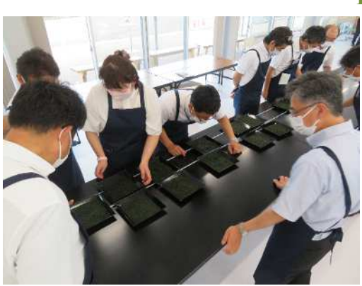
Tea Appearance test

In cooperation with the Saitama Tea Industry Association, we analyze constituents and evaluate appearance of Sayama tea sold in stores and provide information of these results to tea farmers.