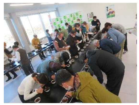
Black tea quality evaluation meetings