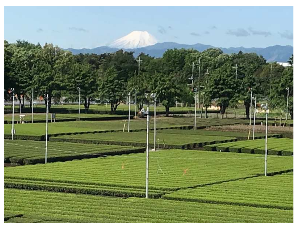
Mt. Fuji seen from the roof of the main building