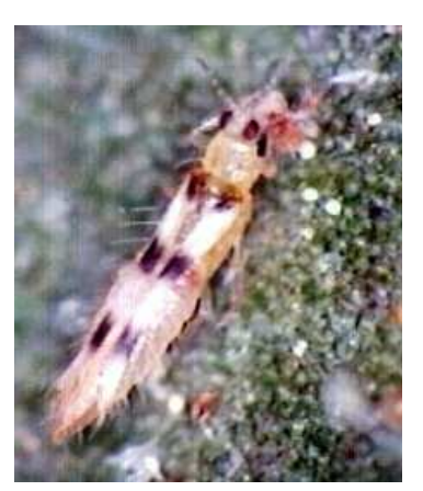
Scolothrips takahashii feeding on Kanzawa spider mite

b. Pest occurrence investigation and providing information of pest forecasting We have set up a pest occurrence investigation field in the research institute to periodically survey the occurrence of pests and diseases, and provide forecasting information through Saitama Prefectural Plant Disease and Insect Control Station.