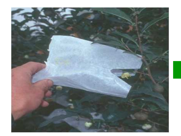
Breeding superior cultivars through artificial crossings