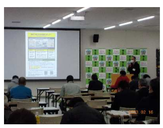
Presentation of research results at a conference