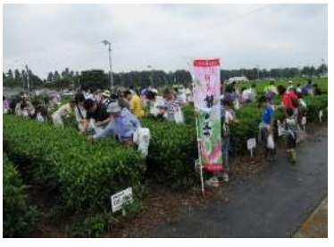
Sayama Tea Plucking Festa

In addition, students from elementary and junior high schools in Iruma City and other areas visit our institute on social field trip or on the experience learning.