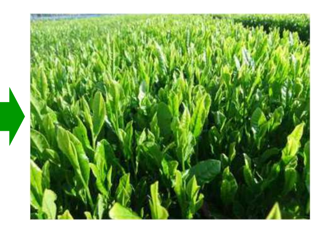
The new cultivar "Sayama-Akari"