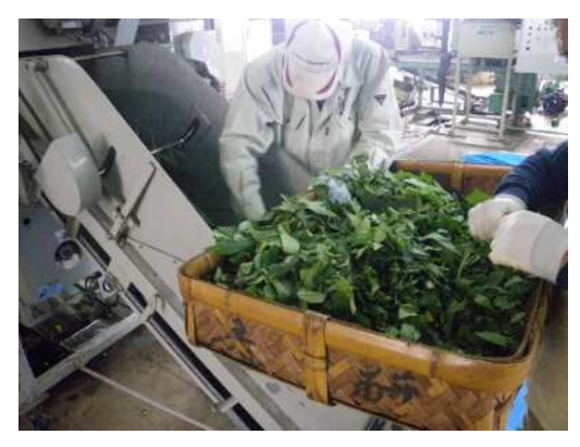
Processing trials with new tea cultivars