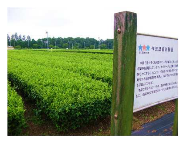
Tea growth monitoring field

In the tea growth monitoring field at our institute, we survay the growth and yield status, as well as sprouting time or plucking time. In this way, we have accumulated basic data over a long period of time. These data will be used to analyze the actual damage caused by cold weather and late frost and to take measures to prevent damage, and will be provided to relevant organizations as needed.