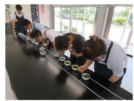
Quality of liquor test