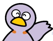
Saitama Mascot, Kobaton