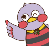
Saitama Mascot, Saitamatch

Saitama Prefecture is committed to supporting the education of high school students through the provision of interest-free loans and school-fee reduction systems. Please see the following for more information about the various types of financial assistance available and how to apply.